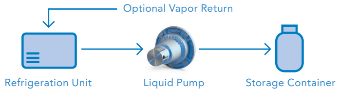
Gear pump used to recover liquid refrigerant

Gear pumps provide a simple solution for removing liquid refrigerant from the “high side” of the system and transferring it to a storage tank.